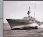
1957 Jaguar class Patrol boats