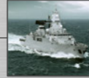
2002 F124 Sachsen class Frigates