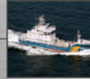
2012 Multipurpose coastal patrol boats