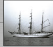
1958 GORCH FOCK Three-mast barque