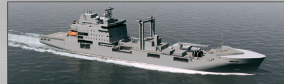
MBV 707 Fleet tankers Under construction