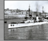
1912 SMS GOEBEN Battlecruiser