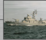
1990 Sassnitz class Fast attack crafts