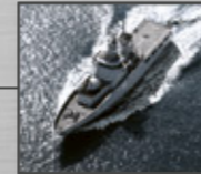
2010 OPV80 Darussalam class Offshore patrol vessels