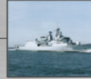
1992 MEKO 200HN Hydra class Frigates