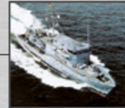
1992 MJ332 Frankenthal class Mine countermeasure vessels