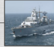
1994 F123 Brandenburg class Frigates