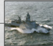
2008 K130 (boats 1-5) Braunschweig class Corvettes