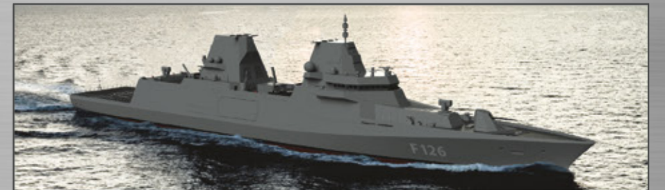
F126 Frigates (as subcontractor) Under construction