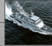
2021 TS60 Coastal patrol boat