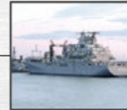
2002 BERLIN and FRANKFURT A. M. EGV type 702 Naval support vessels