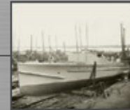
1930 S1 Speedboat