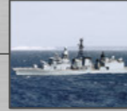
1981 F122 Bremen class Frigates