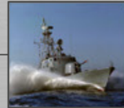
1972 Tiger class Missile speedboats