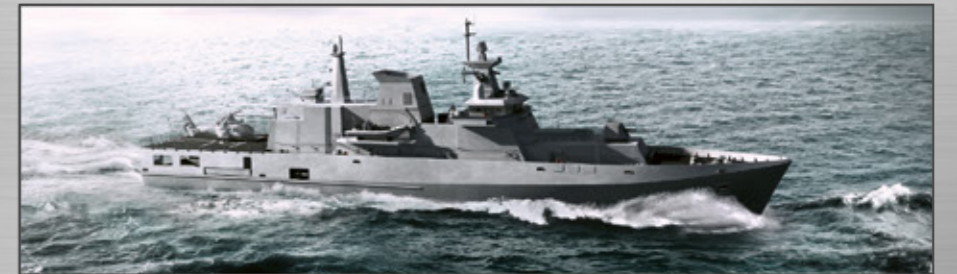
MMPV90 Corvettes Under construction