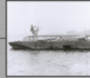
1964 Ilitis class Torpedo speedboats