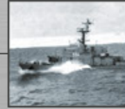
1969 Kondor class, Mine countermeasure vessels