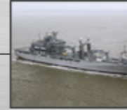
2013 BONN EGV type 702 Naval support vessel