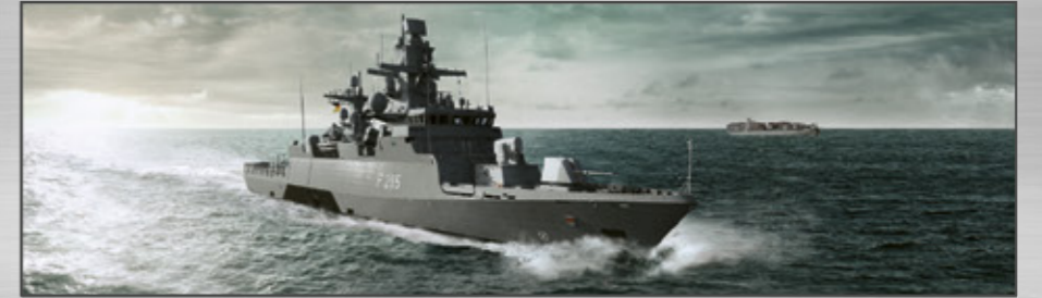
K130 (boats, 6-10) Köln class Corvettes Under construction

Whatever the requirement or the budget, we remain flexible and provide tailored naval solutions from a single source. The breadth of our expertise is demonstrated by our portfolio, ranging from fast patrol boats and offshore patrol vessels to corvettes, frigates, mine countermeasure vessels and logistic support ships.