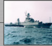
1981 Parchim class Corvettes