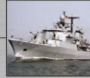
1982 MEKO 360 Frigate