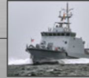
2016 OPB40 Offshore patrol boats