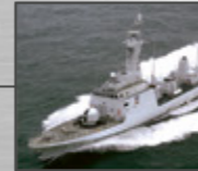
1998 FPB 57 Kiliç class Fast patrol boats