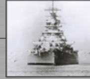
1940 BISMARCK Battleship