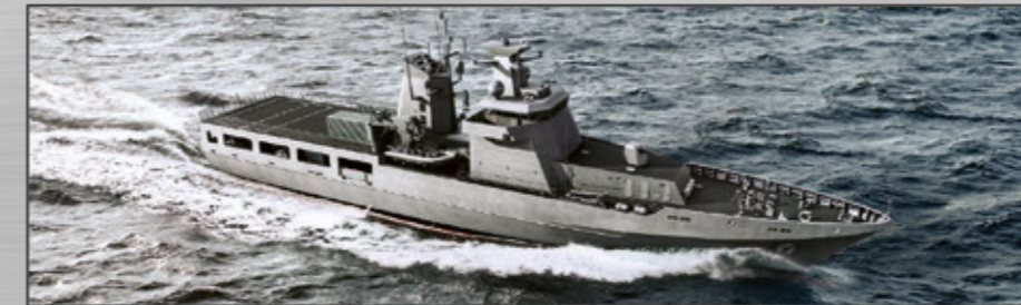
SEA 1180 Arafura class Offshore patrol vessels Under construction