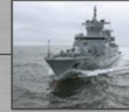
2019 F125 Baden-Württemberg class, Frigates