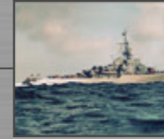
1957 Krake class, Mine countermeasure vessels