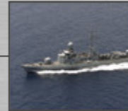
1982 143A Gepard class Fast-attack crafts